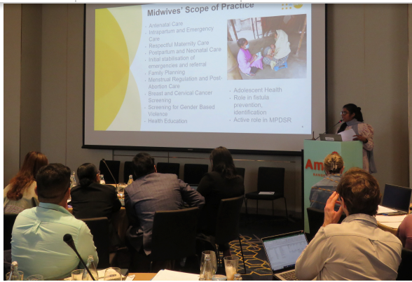
A participant delivers a speech during the workshop in Bangkok Thailand

UNFPA supported government participation in a Bangkok workshop on operationalizing the Ending Preventable Maternal Mortality and Every Newborn Action Plan from March 18-22, 2024. Delegates from Mongolia's Ministry of Health and the National Center for Maternal and Child Health shared insights on maternal, newborn care, and midwifery while gaining best practices and knowledge from the regional experts.