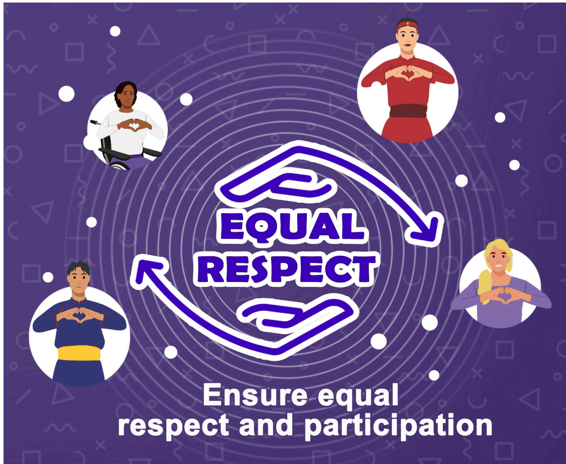
"Equal Respect" campaign poster, @UNFPA