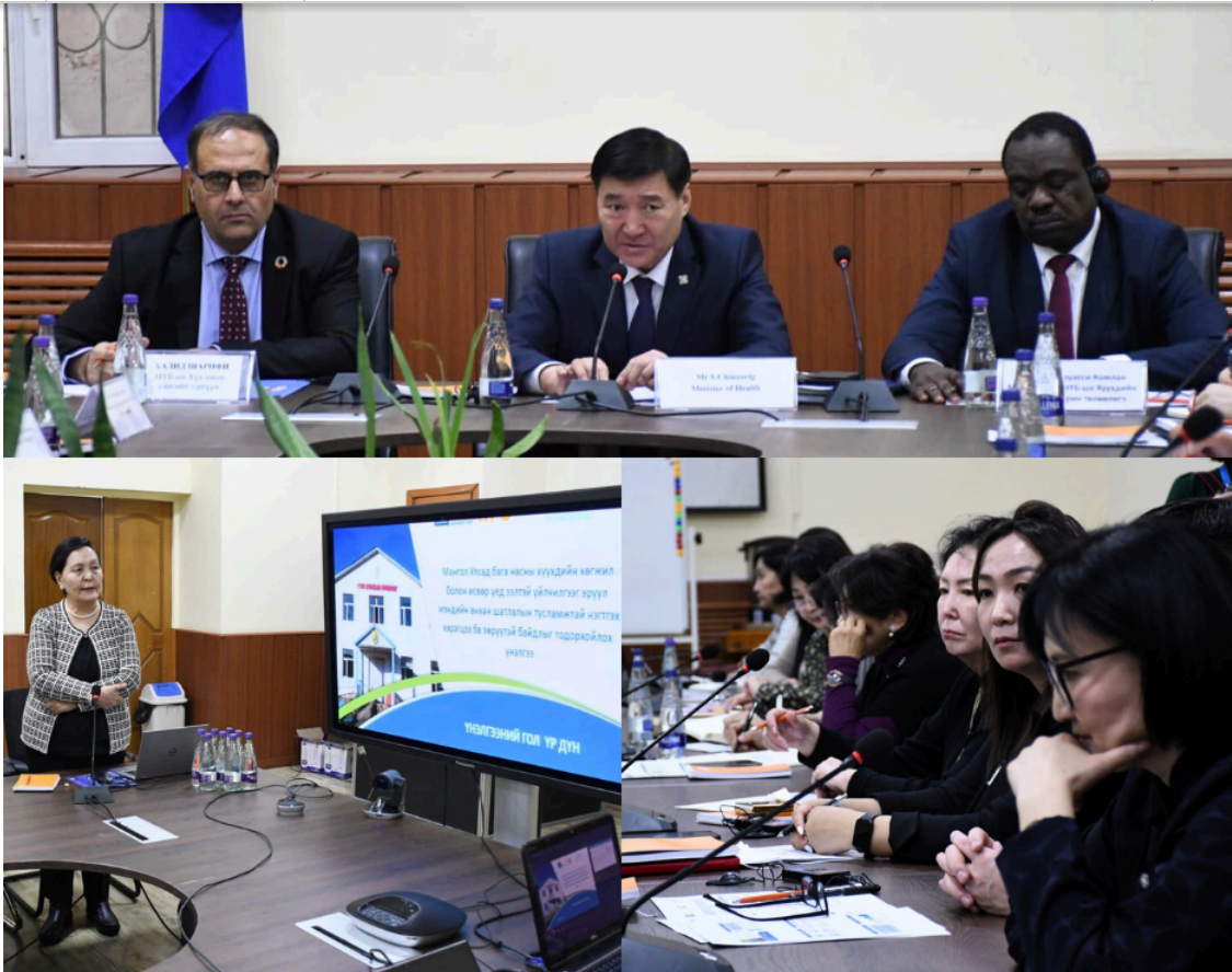
Minister of Health Mr. Chinzorig Sodnom along with participants at the meeting to present the research results on 26 January 2024 at the Ministry of Health, @UNFPA