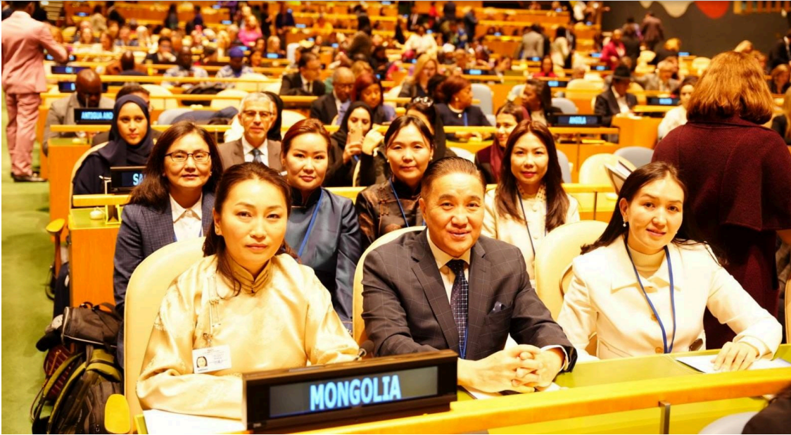
Government delegates, including Minister of Labor and Social Protection Ms. Bulgantuya Khurelbaatar, joining the 68th session of the UN Commission on the Status of Women in New York, USA, 2024