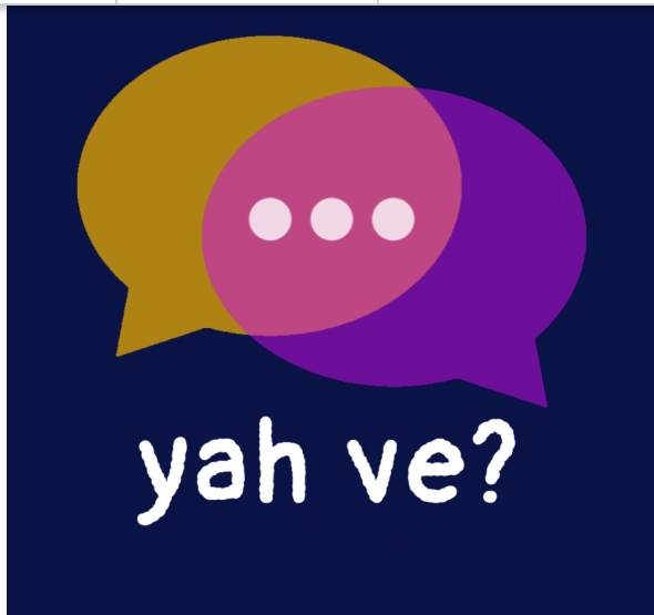
"Yah Ve?" Facebook page cover