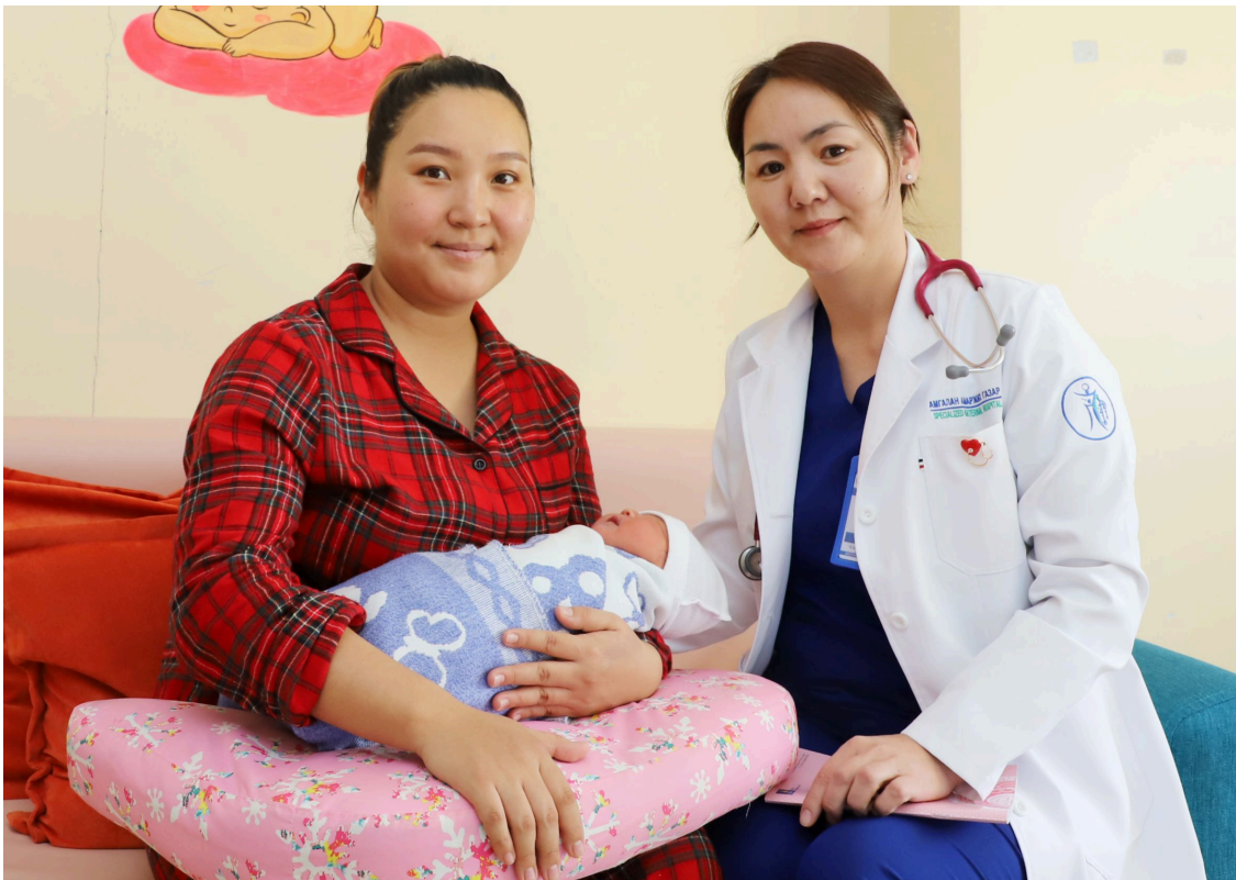
A mother with her newborn and a medical doctor at a maternity hospital in UB, 2023