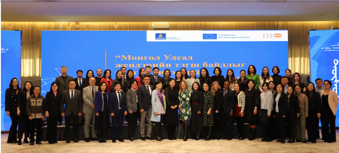
Representatives from governmental and non-governmental organizations after the project launch on 1 March 2024, in Ulaanbaatar, @UNFPA