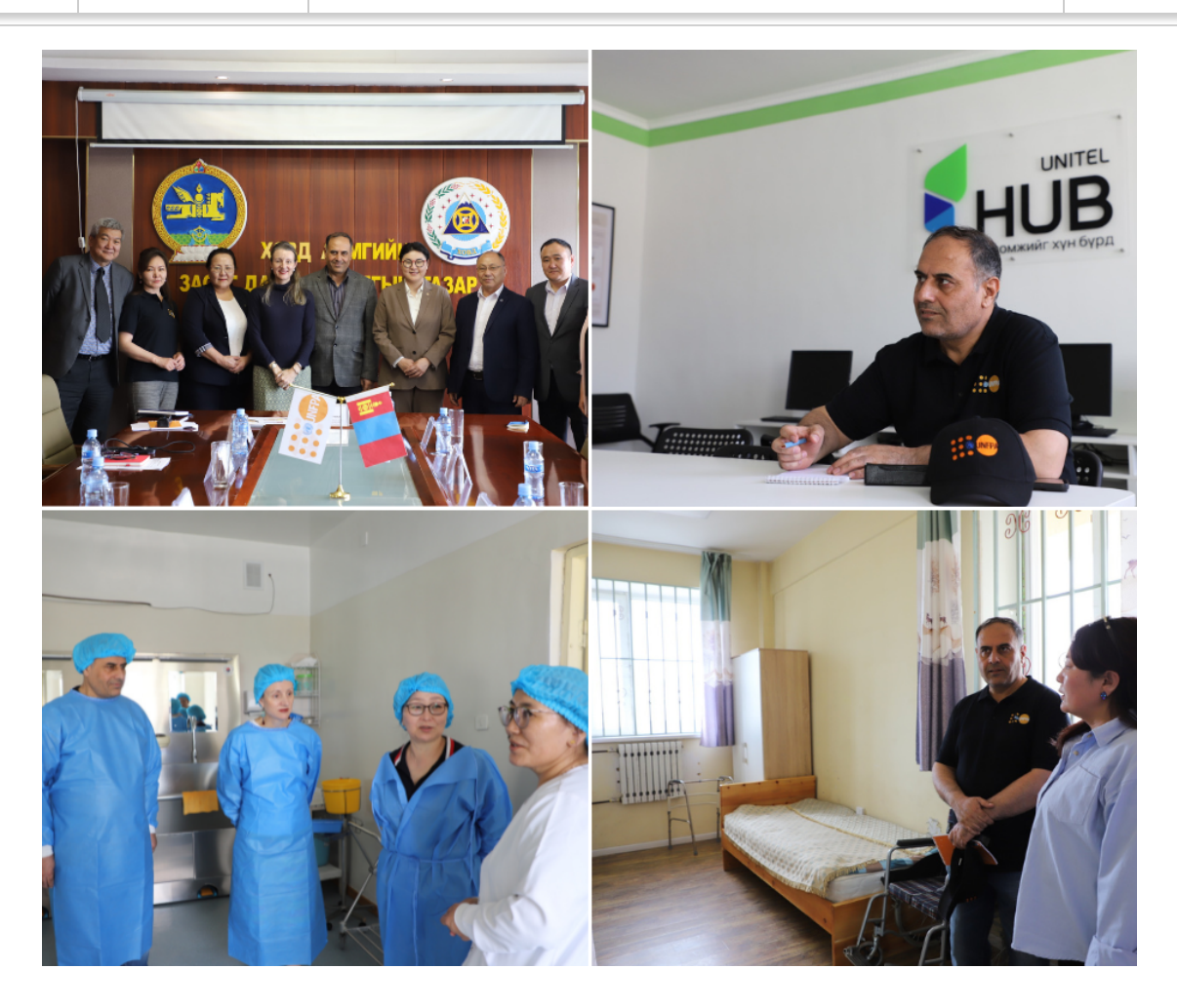
Photo collage of a field mission to Khovd province between 14 - 17 May 2024.