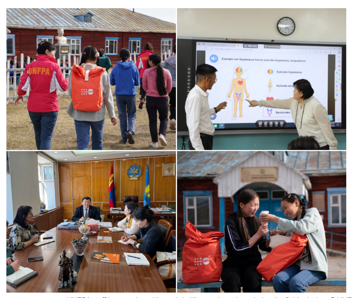
UNFPA staff is engaging with youth in Khuvsgul province during the field mission.