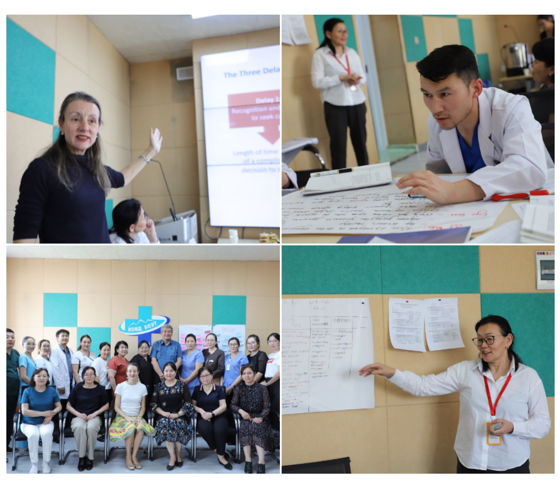
UNFPA staff along with training participants in Khovd province.