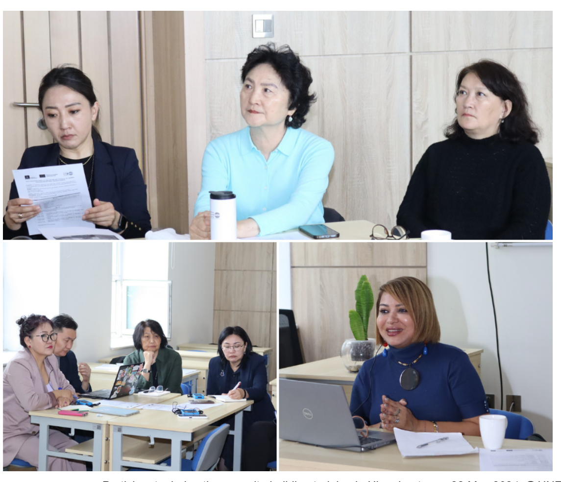
Participants during the capacity-building training in Ulaanbaatar on 28 May 2024.