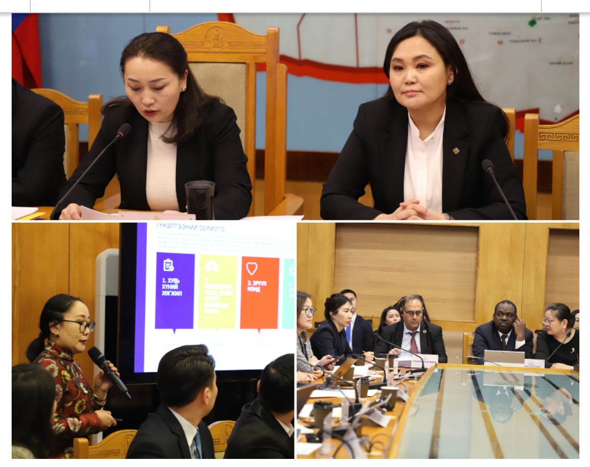
Minister of Labor and Social Protection Kh. Bulgantuya and Minister of Culture Ch. Nomin along with participants during the meeting on 3 April 2024 at the Parliament House, Ulaanbaatar. @UNFPA