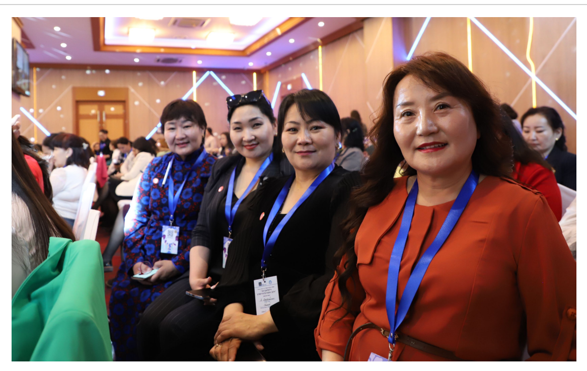
Midwives during the consultation meeting on 5 May 2024 in Ulaanbaatar.