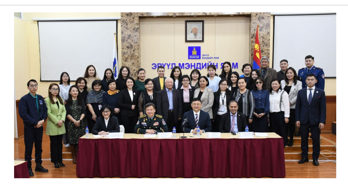
Key stakeholders during the national workshop on 12 April 2024.

A total of 300 midwives from the countryside and capital city participated in the meeting to celebrate the work of generations of midwives and pay tribute to their dedication to their highly responsible work for mothers and babies to bring happiness to families. With the support and technical guidance from UNFPA, the National Midwife Development Action Plan -2030 was developed, and discussed among the participants. UNFPA also carried out a information campaign, producing various social media_posters and "One Day of a Midwife" video.