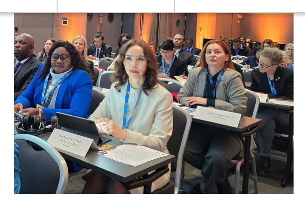
Ts.Munkhtsetseg participating in the 8th International Parliamentarians' Conference in Oslo, Norway on April 17, 2024.