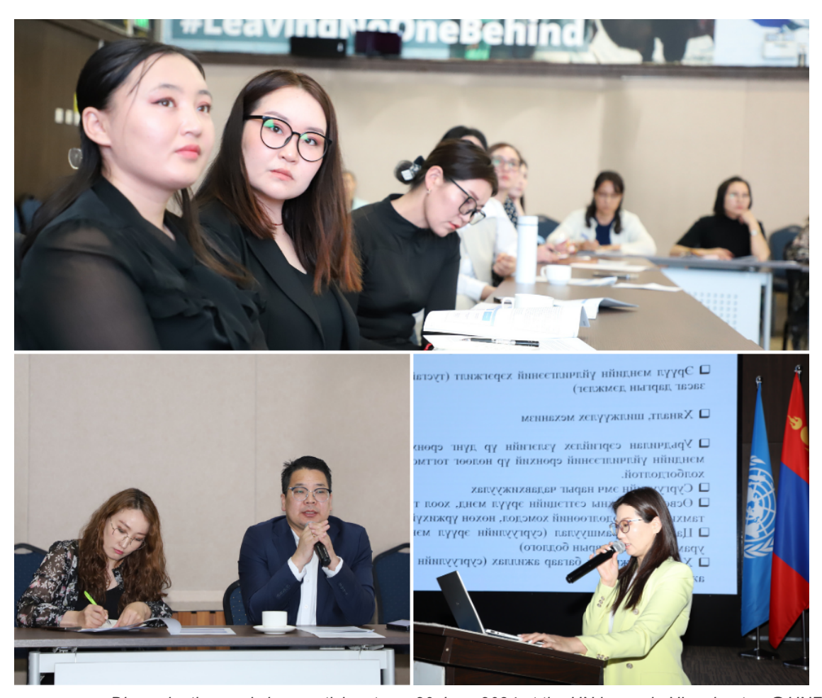
Dissemination workshop participants on 20 June 2024 at the UN house in Ulaanbaatar.