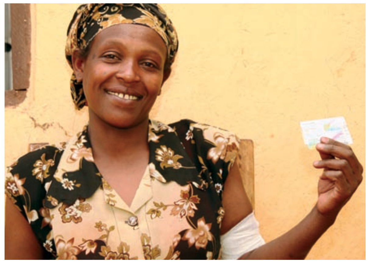
A woman in Ethiopia shows her family planning card after Implanon, a long-lasting modern method of contraception, was surgically inserted in her upper arm.