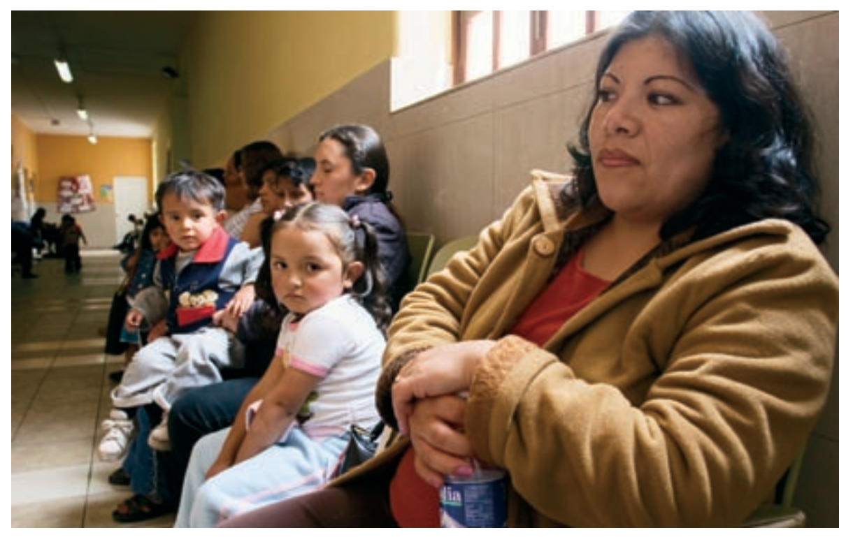
Women and children at a UNFPA-supported maternity clinic.

Mongolia. The Government increased the budget allocation to 100 million Tugrug (US$ 70,000) in the 2010 national budget and committed to funding 100 percent of the contraceptive supply by 2015.