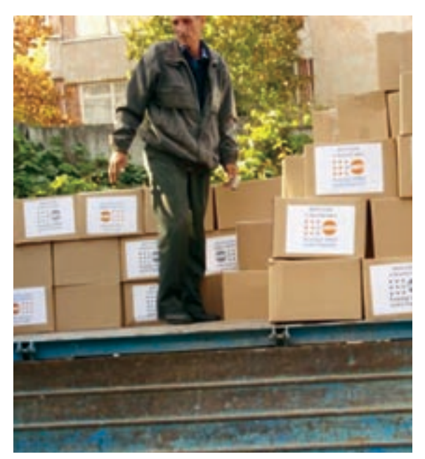
Essential reproductive health supplies being delivered.

Sierra Leone ranked 180 out of 182 countries in the 2009 Human Development Index