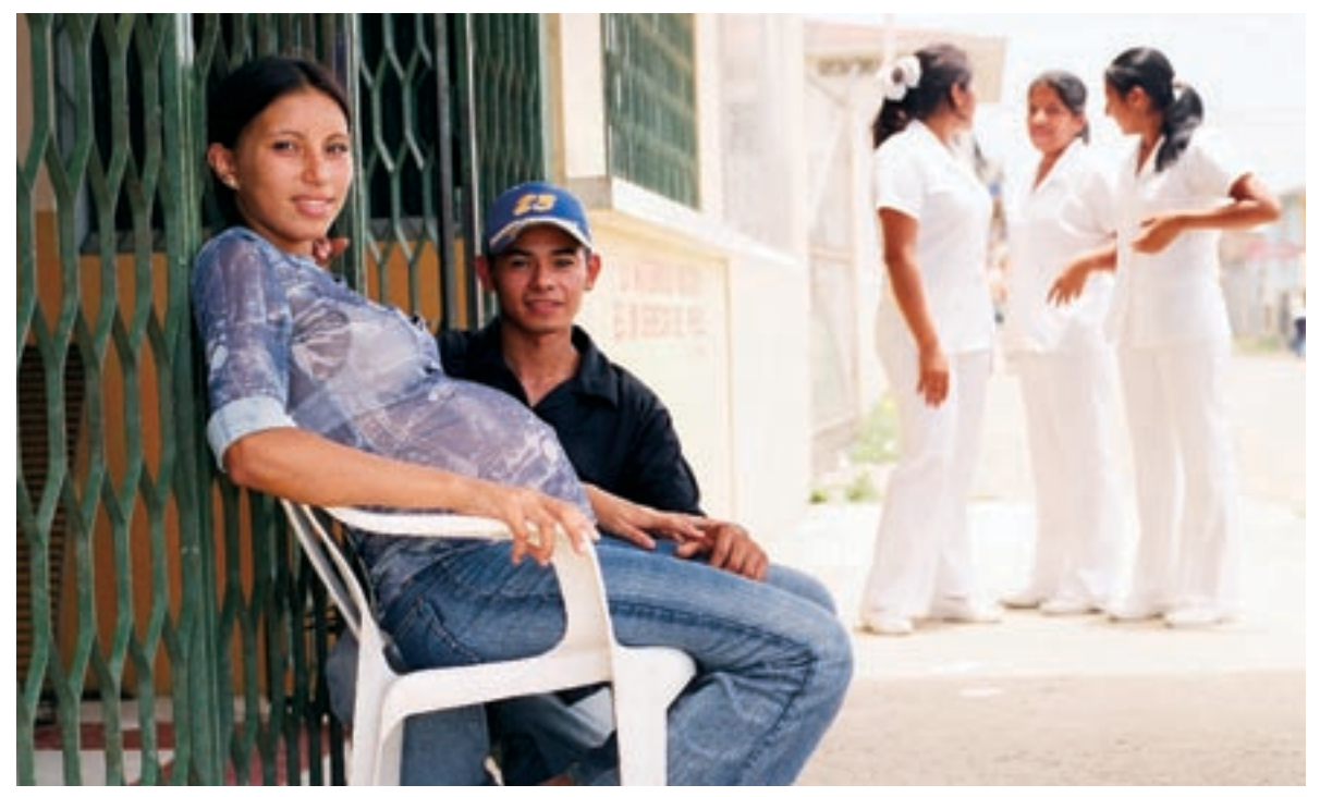
A young pregnant woman in early labour and her partner wait outside a maternity clinic.

communicated to the provincial and central levels. Different levels of managers provide periodic on-site supervision visits that also provide on-the-job training in the catchment villages, depending on local needs.